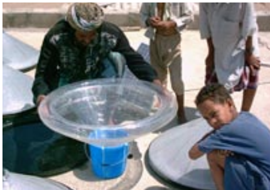
The Watercone uses sunshine to distill water, Aden, Yemen.

Living machines and industrial microbes could, of course, work together, with microbes cooking off hydrogen in vats linked to tanks of marsh plants and hungry snails—producing energy and cleaning water at the same time. (For one